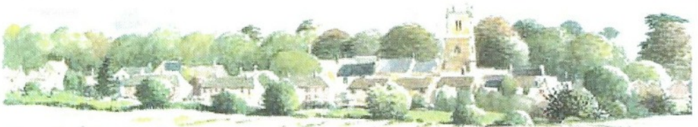
The village of Ecton and church

Ecton is a small Northamptonshire village and parish in the Borough of Wellingborough. It is situated on a hill, built around a church and a historic hall all set in green fields and mature trees. It has two pubs and a school. A conservation area, the character of the village is typified by houses built of traditional ironstone and more modern pre and post-war brick built construction. The village celebrates a historical connection to the ancestors of Benjamin Franklin.