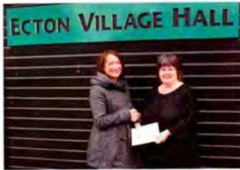
Pictured - The most recent cheque presentation