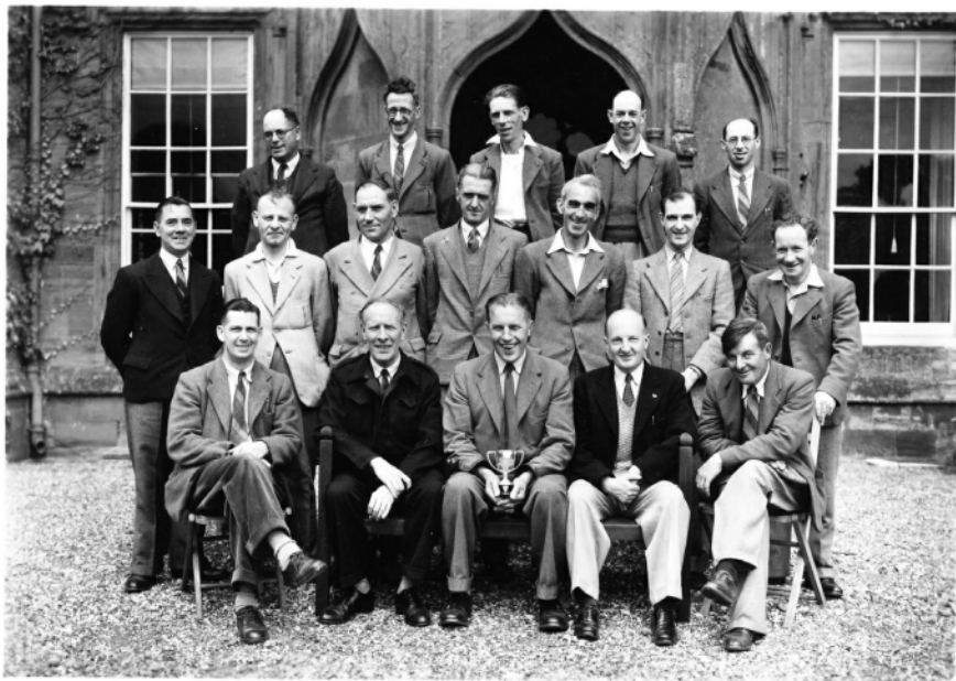
Agricola R.C. and Ecton M.R.C. July, 1946.