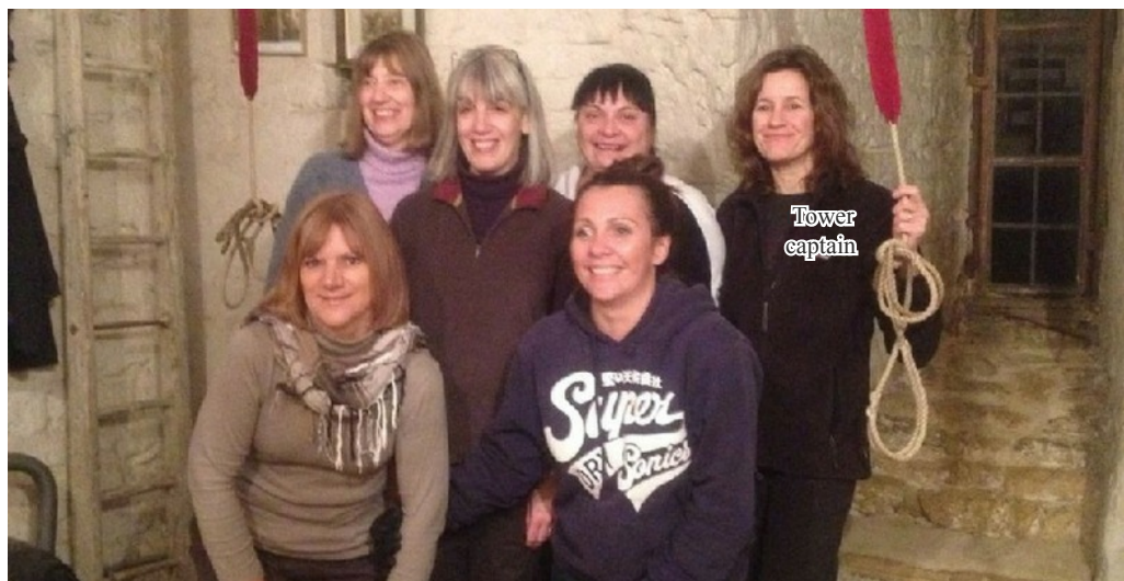
ECTON'S all girl church bell-ringing band