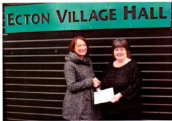
Pictured - The most recent cheque presentation