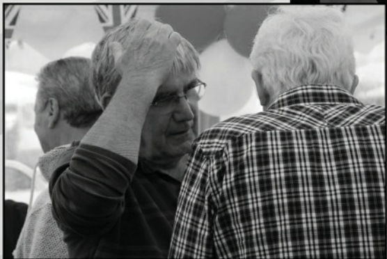
DIFFICULT DECISIONS FOR THE JUDGES