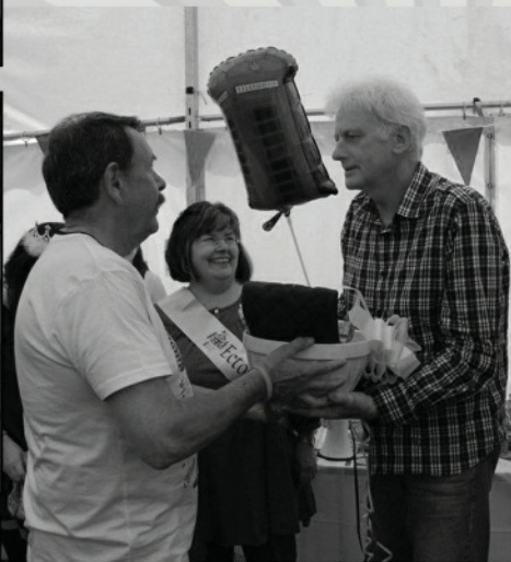
THE WINNING PIE MAKER