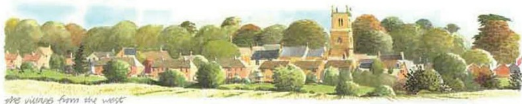
the village from the west

POLICE SIRENS, MICROLITE AIRCRAFT AND MOBILE PHONES.