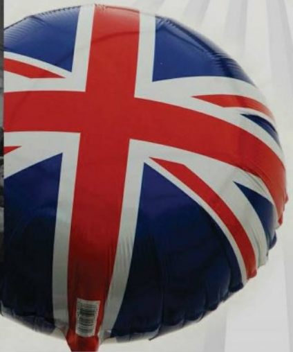
A GREAT DAY HAD BY ALL