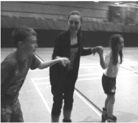
Roller Skating at Benham