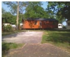
Kingfisher Lodge Sleeps 6