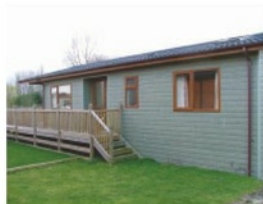
Forest Lodge Sleeps 4