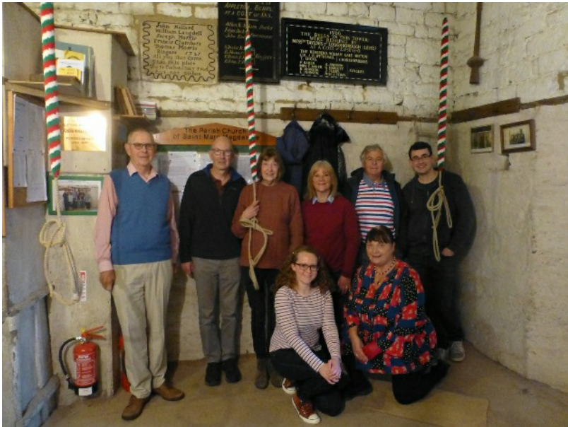
Photo below of the Ecton Bell Ringers, taken following the Coronation Ringing on 6 th May 2023, for the Coronation of King Charles III, they then went on to ring at Wilby and Gt Doddington Churches.